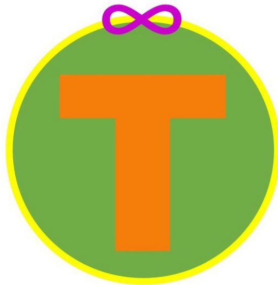
Table 2. General Idea of the Truality Symbol.